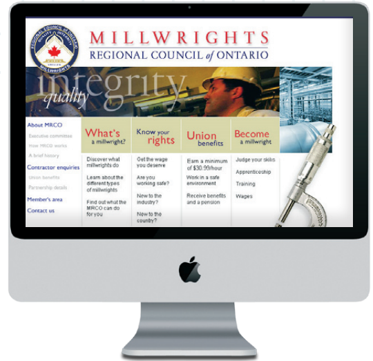
MRCO Web Site ( www.millwrightsontario.com )

The MRCO and Ideological Systems have worked in partnership to develop systems to communicate information more effectively between local offices, other unions and their members. This partnership ensures that technology and member dues are used to the fullest.